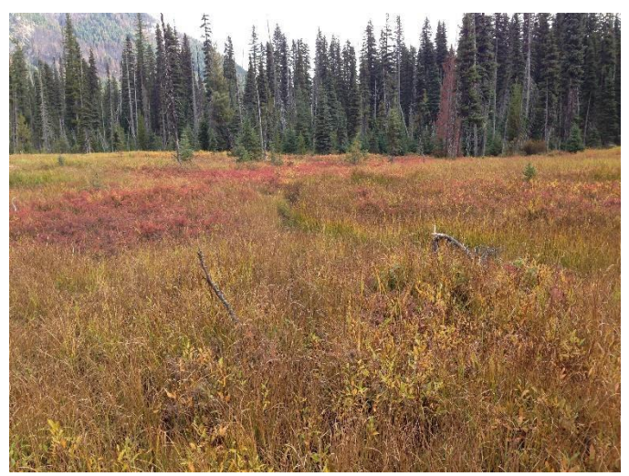
Marsh on the American River in Washington.