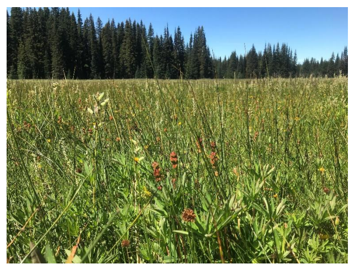
Muddy Creek Meadows near Mt. Adams, Washington.