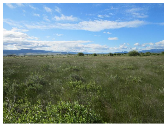
Fen at headwaters of Clarks Fork in Montana.