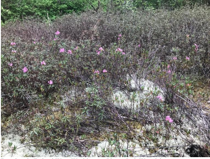
Rare bog in Federal Way, Washington.