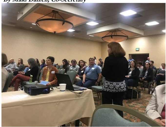
2017 Kelso Mini-Chapter Conference.

We met in Kelso back in 2017, and it has been a while since we met in-person! The SWS PNW chapter will be hosting a one-day Chapter Conference in Lacey, WA on November 3, 2022. Check out the latest schedule on <u>our website</u>. We have great speakers lined up for our conference!