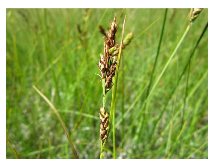
Sedgey goodness in Montana.